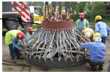
2011 - Dome Roof Installation