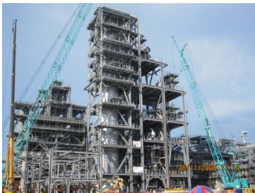
2010 - 1 st BioDiesel Plant in S'pore