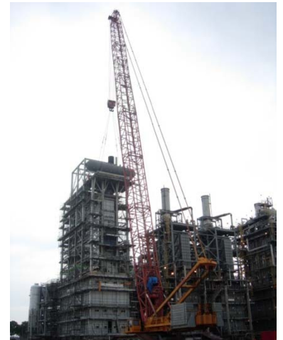
2007 - SCP Furnace