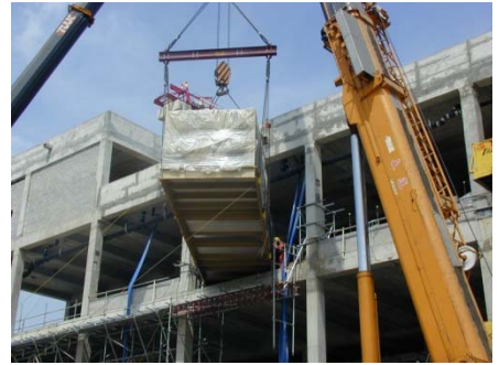
2006 – Equipment Installation, Pharma